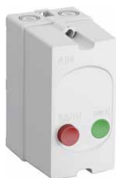
Empty enclosure with push-button

4 to 7.5 kW, protected by thermal overload relays, AC or DC operated - continued