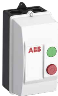
Empty enclosure with push-button